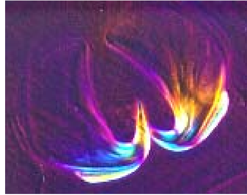
Posterior attachment hooks of an Encotyllabe sp. (Monogenea) from the pharyngeal tooth pads of a bony fish from the Great Barrier Reef.