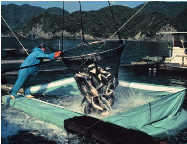
Freshwater bathing of kingfish ( Seriola spp.) in Japanese aquaculture to 'clean' their skin of Benedenia seriolae (Monogenea)