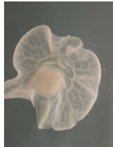
Nasicola klawei (Monogenea) from the nares of yellowfin tuna