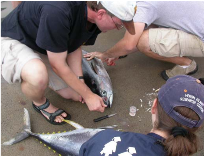
Removing parasites from the nares of a yellowfin tuna ( Thunnus albacares ) at Port Stephens Game Fishing Tournament in March 2006