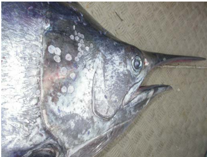
Large monogenean (flatworm) ectoparasites on skin of operculum of a marlin at Port Stephens Game Fishing Tournament (March 2006)