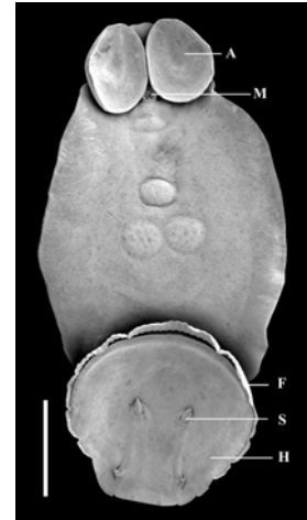
The culprit: Benedenia seriolae (Platyhelminthes: Monogenea: Capsalidae)