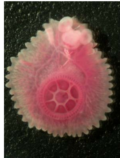
Capsaloides magnaspinosus (Monogenea) from the nasal tissue of striped marlin ( Tetrapterus audax )